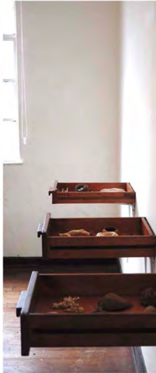
Installation Mix media High- Mid- Low-temperature ceramics Bogotá, 2017

The endless forms observed in nature are the main stimulating force in my creative work. I have been keen to collect and preserve beautiful natural objects and have created my nature-inspired treasures within their narratives.