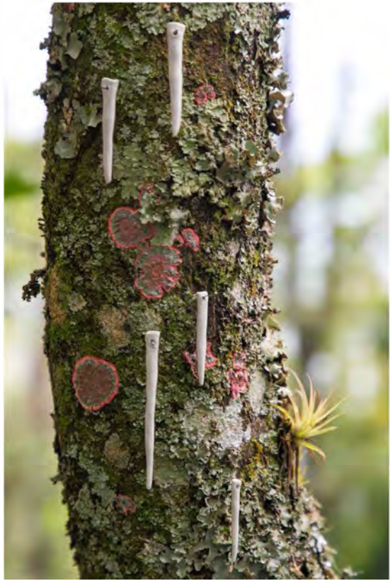
Installation Porcelain, wood, and soil Bogotá 2018

This work is about memory. How morbid and delicate it is to be attached to the past. Keeping alive with micro painful gestures, what already has passed away.